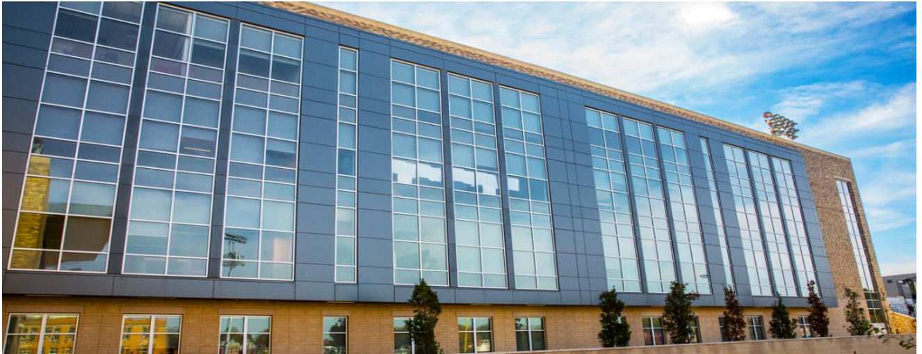
Dunbar Senior High School, Washington DC

Plate XP (PXP) is the advancement of thick metal exterior/interior cladding, providing designers with creative precision, long-term sustainability and permanence. This open-joint, back-ventilated rainscreen system achieves striking and aesthetic complexity by using solid metal plate sheets with long-term visual consistency & ROI.