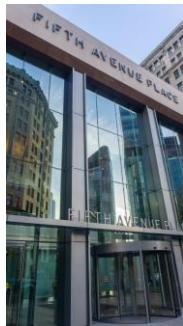
Fifth Ave Place, Pittsburgh PA